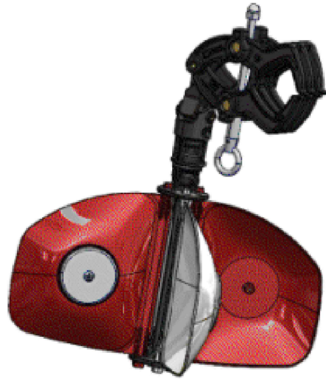
ISOMETRIC VIEW N.T.S