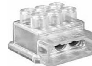
ITEM 11 REFER NOTE 7

TO BE READ IN CONJUNCTION WITH CONSTRUCTION DRG No. S03-01-05-12