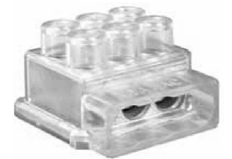
ITEM 11 REFER NOTE 7

TO BE READ IN CONJUNCTION WITH CONSTRUCTION DRG No. S03-01-05-12