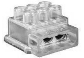
ITEM 11 REFER NOTE 7

TO BE READ IN CONJUNCTION WITH CONSTRUCTION DRG No. S03-01-05-12