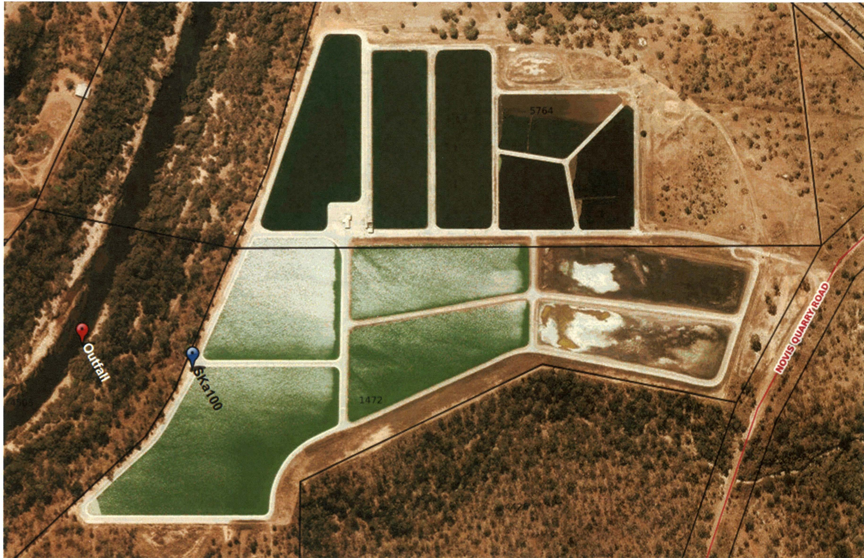
Figure 2 - Site layout, SKa100 and outfall into Katherine River