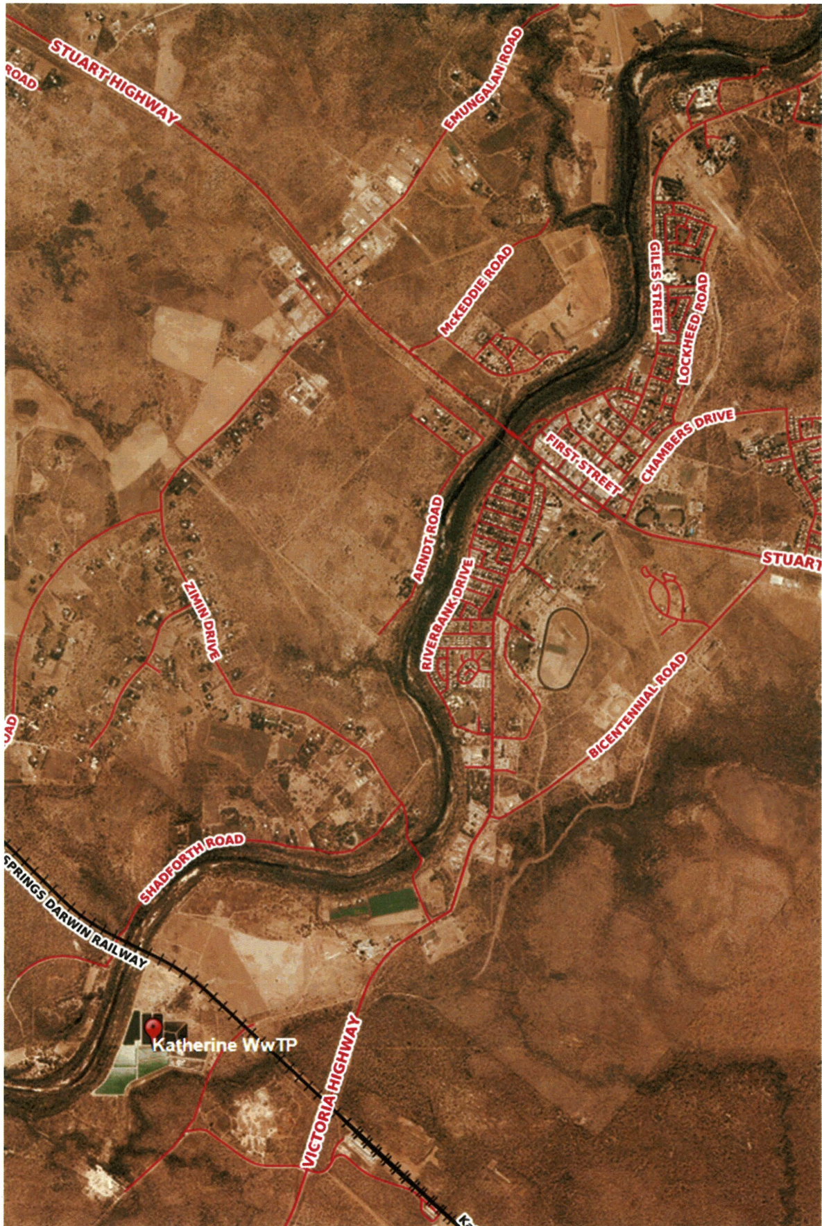
Figure 3 - Premises location