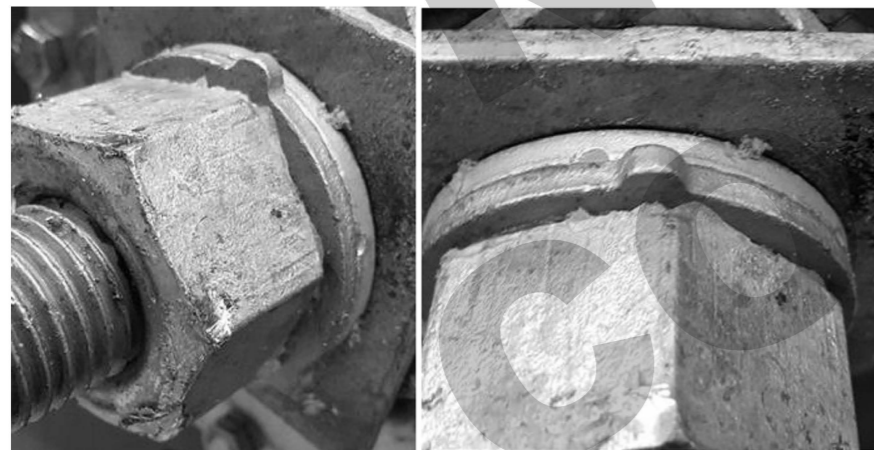
DETAIL B FINAL ORANGE GEL SQUIRT