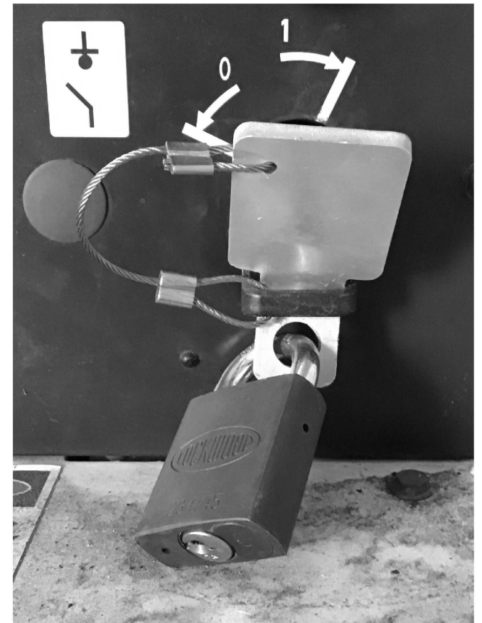
EXAMPLE OF INSTALLED COVER