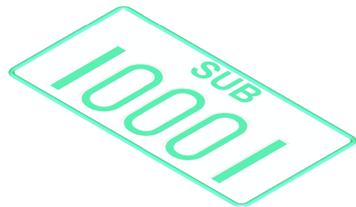
SUBSTATION NUMBER PLATE ISOMETRIC VIEW SCALE N.T.S.