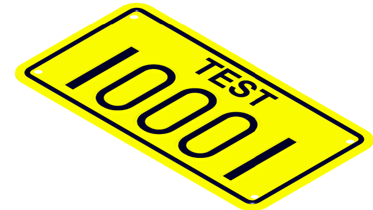
TEST NUMBER PLATE ISOMETRIC VIEW SCALE N.T.S.