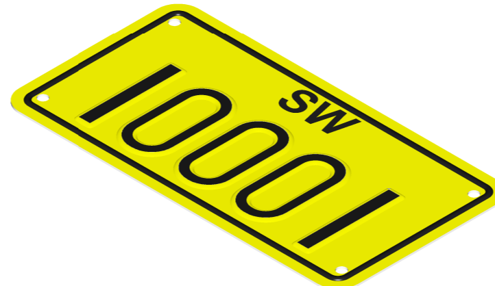
DISTRIBUTION SWITCHGEAR NUMBER PLATE ISOMETRIC VIEW SCALE N.T.S.