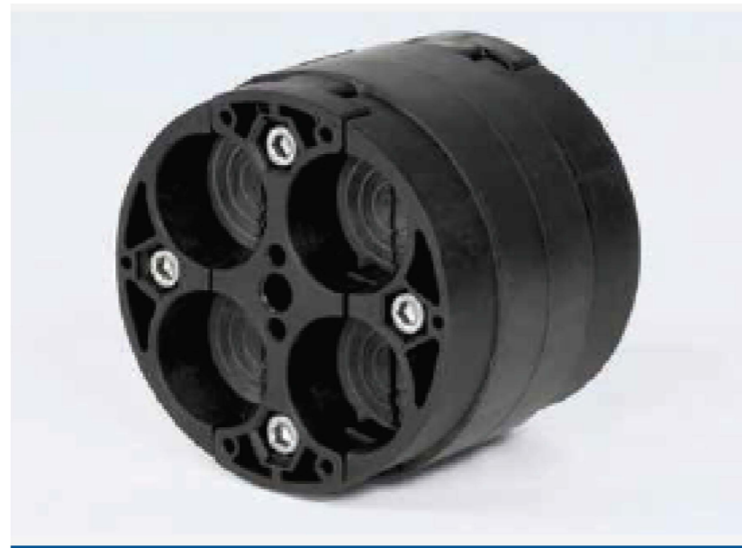
OPTION 1 CONDUIT PLUGS

THE FOLLOWING ITEMS SHALL BE USED FOR CIRCUMSTANCES REQUIRING A CONDUIT SEAL PARTICULARLY FOR WATER INGRESS INCLUDING INDOOR SUBSTATION SWITCHING STATION AND INTAKE STATION. ITEMS TO BE APPLIED AT ENTRY POINT TO SOURCE END